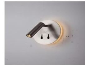
3W Reading Light + 6W Backlight