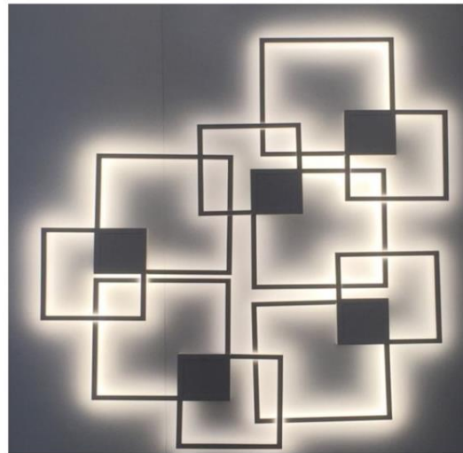
Fair n' Square Synthesis